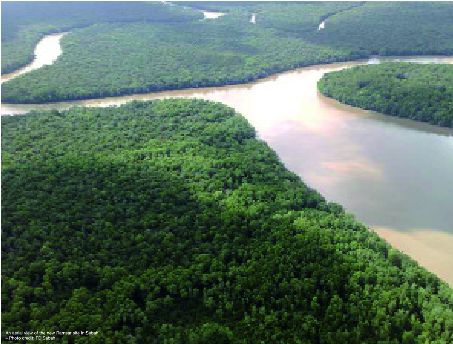
An aerial view of the new Ramsar site in Sabah.